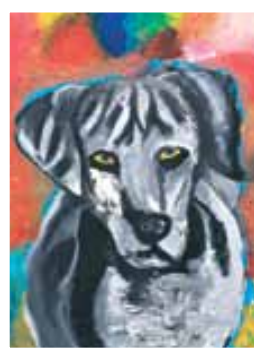
Dog I like dogs and wish I had a pet dog.