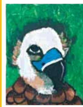
King of the Sky I first saw a vulture at the Jurong Bird Park.