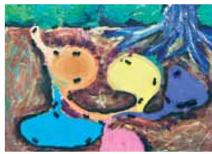
Black Ants Nest My favourite part was making the 'ants' and sticking sand on the canvas.