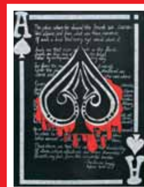
Ace of a Thousand Spades A bleeding ace of spades on black background with white crackle paint.