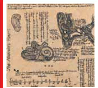
Stimuli of a Vibrational Nature Pen drawing of the ear.