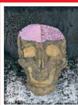
On Insanity and Other Delightful Things Human skull on greyscale background.