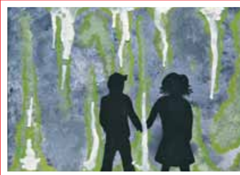
Walking the Night Throughout Couple holding hands on canvas with dripped-wax effect.