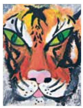
The Tiger King He rules the world with kindness.