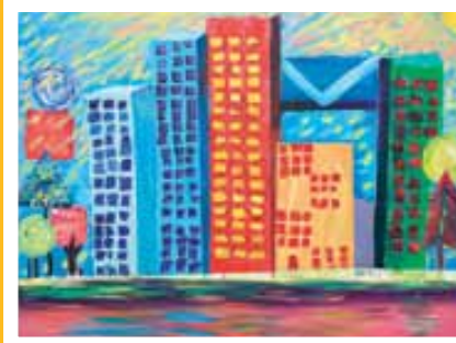
My Dream Buildings I wish there were no cars, so I could cycle everywhere. The air is clean, and it's always sunset – my favourite time of the day.