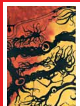
Firing of the Synapses Neurons on gold and bronze background.