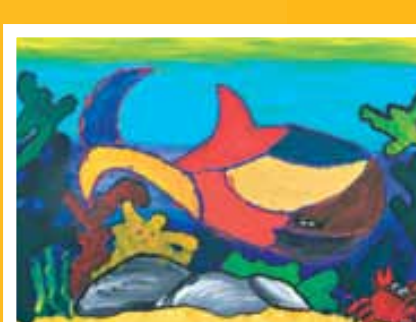
Sea Giant The crazy fish I drew became a crazy giant whale.