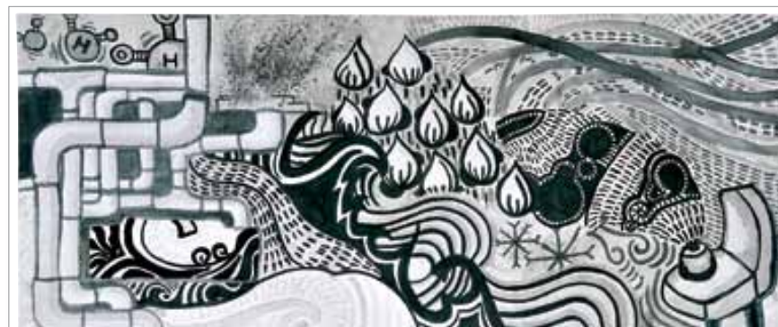
The 60% miracle Ink on paper scroll.

Visit www.ocbctodayfund.sg or call the Singapore Children's Society fundraising department at 6273 2010.