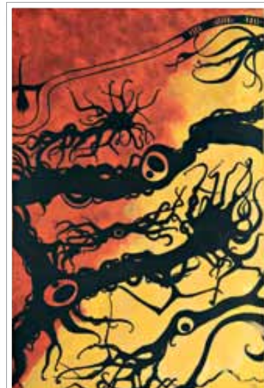
Firing of the synapses Neurons on gold and bronze background.