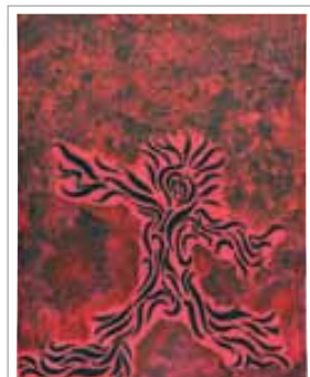
Dance of the flowers Dancing figure on pink and black spotted background.