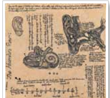
Stimuli of a vibrational nature Pen drawing of the ear.