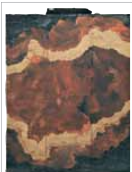
In those dark recesses... Bronze and black acrylic on cardboard.