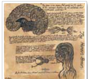
Through which we perceive Pen drawing of the brain.