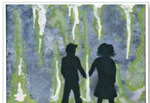
Walking the night throughout Couple holding hands on canvas with dripped wax effect.