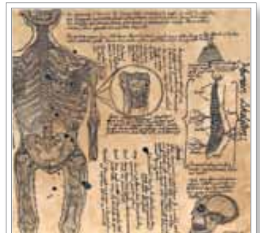
These old bones Pen drawing of the skeletal system.