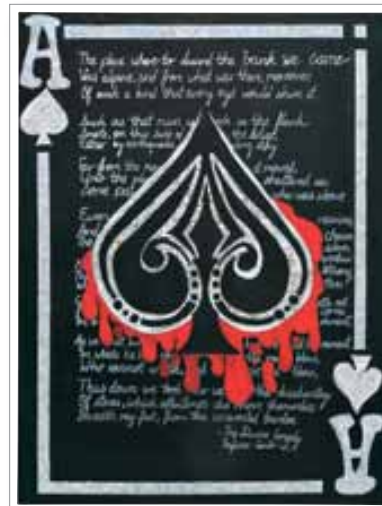
Ace of a thousand spades A bleeding ace of spades on black background with white crackle paint.