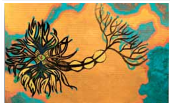
That which we think in isolation Single neuron on gold background.