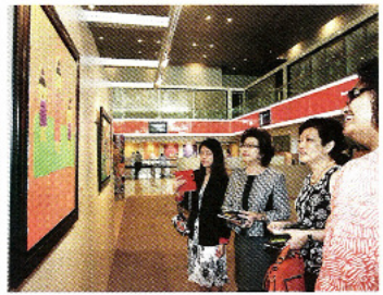
Guests at the launch of the fund viewing the paintings.

with emotional needs. We are fully equipped to do it because we have 66 professional staff, including 17 social workers and 37 counsellors. We also have psychologists who are trained and competent to help (these children)," he said.