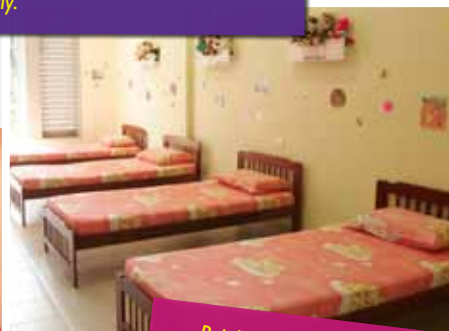
Bright and airy bedrooms for the children to keep their spirits up!