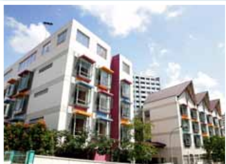
The Convalescent Home is now known as Sunbeam Place. It moved to its current address at 28 Hong San Terrace in 2006. It is co-located with Evergreen Place, a home for the elderly.