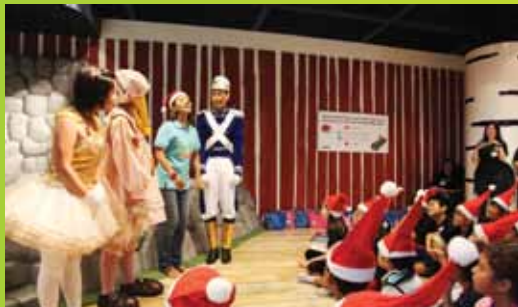
The animated characters and their stories kept everyone enthralled.