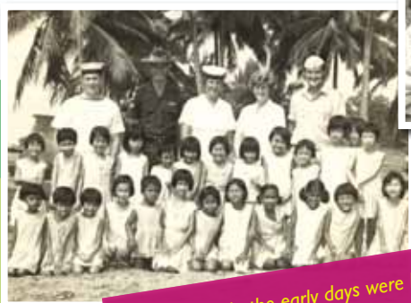
Volunteers in the early days were British servicemen and their families.