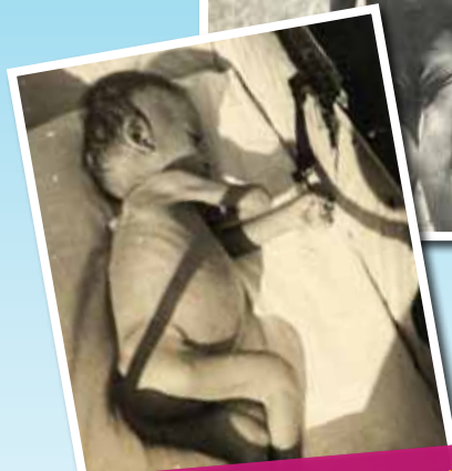
In the 50s and 60s, children sent to the Convalescent Home were ill or malnourished.

The scene in the years following the Second World War was dismal. There was widespread concern about the lack of proper care for children in Singapore. This stemmed from many parents' lack of awareness or means to provide for their children. Many were malnourished and hospital staff observed that beds were taken up by children whose medical condition did not require the services of a hospital, and these children were often re-admitted.