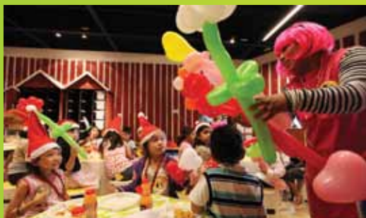
Ingredients for a fantastic party: great friends, great food and sculpted balloons.