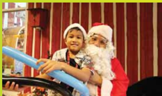
And Santa Claus to complete the party!