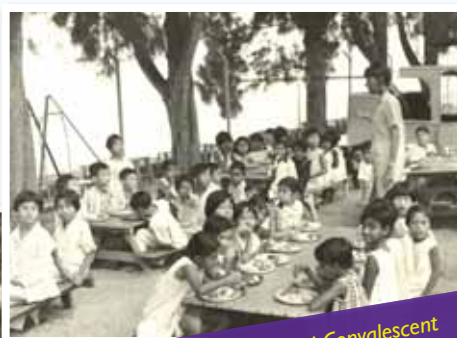
Mealtime at the Changi Convalescent Home, with a view of the sea!