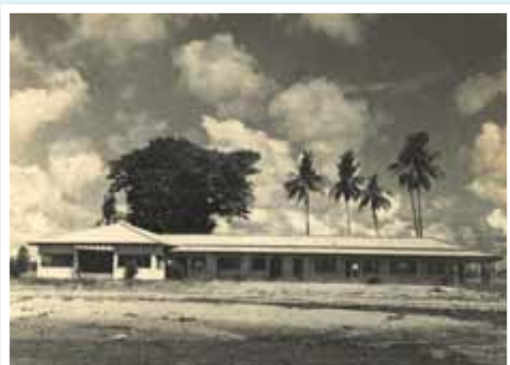
Residents of the Convalescent Home at Changi enjoyed a serene seaside environment.

The Keramat Road home was officially opened on 8 May 1977 by First Lady Mrs B. H. Sheares. The children adapted well to the move and the relocation from the seaside to a hilltop did not dampen the atmosphere of the Home. Despite a more remote location, volunteers continued to visit the children – spending time with them through fun activities and providing help with tuition.