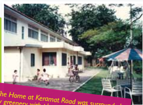
The Home at Keramat Road was surrounded by greenery with plenty of fresh air.