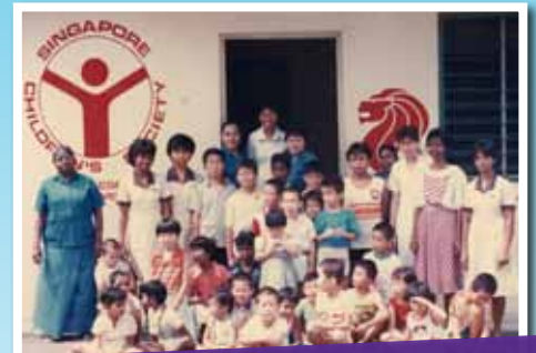
Staff and residents of the Home in the 1990s. Children's Society staff and the children it served came from all races and religions.