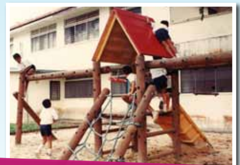
Over time, facilities were added to the Convalescent Home for the benefit of the children.