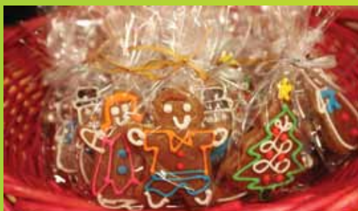
Gingerbread cookies for the festive mood...

Fifteen children from our Children Service Centre were treated to a wonderful Christmas party at the Nation of Småland in IKEA.