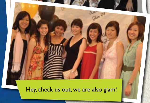
Hey, check us out, we are also glam!