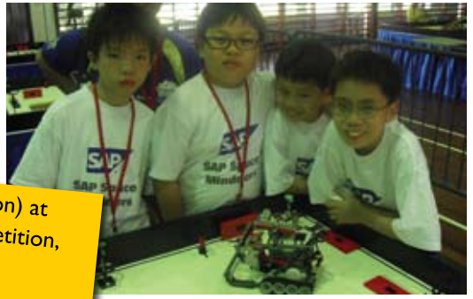
Children from Student Care Centre (Henderson) at the First Lego League Singapore. For the competition, they had to design a vehicle to the theme of "Smart Move – Transforming Transportation." These boys scored second place during the trials.