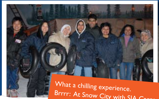
What a chilling experience. Brrrr: At Snow City with SIA Cargo.

While we are well on our way into 2010, we would like to take this opportunity to bring you the highlights of 2009, in pictures. Last year's calendar was certainly filled with events and these have created many wonderful memories for us. Let's share some highlights together.