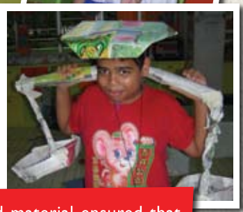
Costume Day using recycled material ensured that participants were not being wasteful.