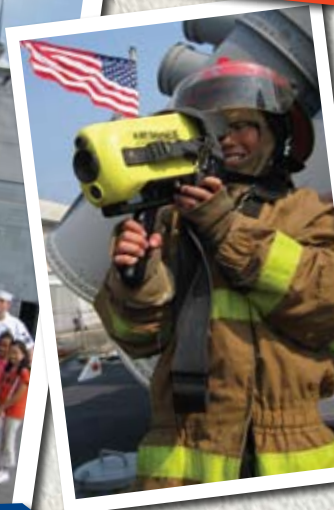
Yes, our very "firefighter" on duty on board the US navy vessel.