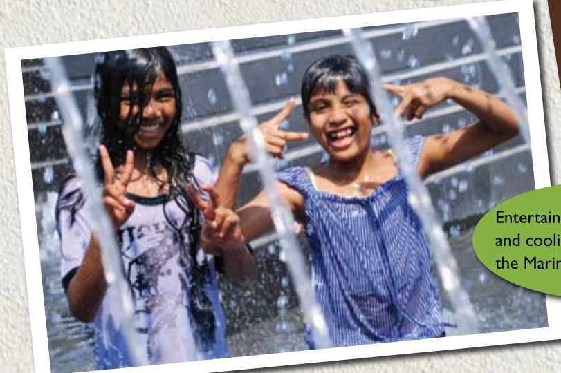
Entertaining and educational, and cooling off on a hot day at the Marina Barrage.