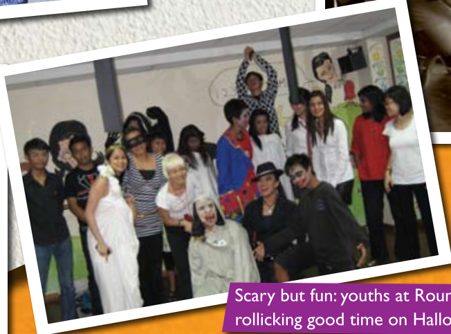
Scary but fun: youths at RoundBox having a rollicking good time on Halloween.