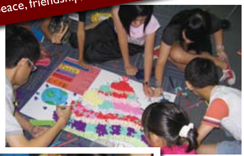
Students of Jiemin Primary learn the values of peace, friendship, hope, resilience and respect.