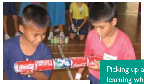
Picking up a valuable skill: learning what team work is about at Camp V-Nest.