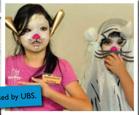
At Camp Positive organised by UBS.