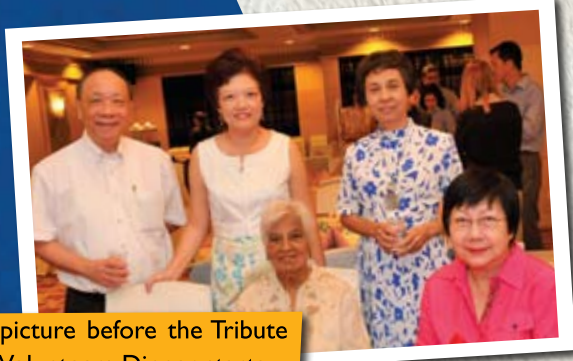
A picture before the Tribute to Volunteers Dinner starts.