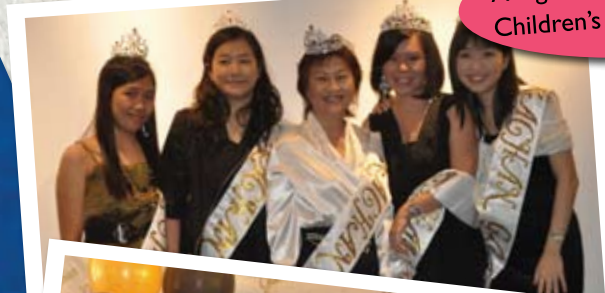
A big round of applause for our Children's Society Glam Queens.