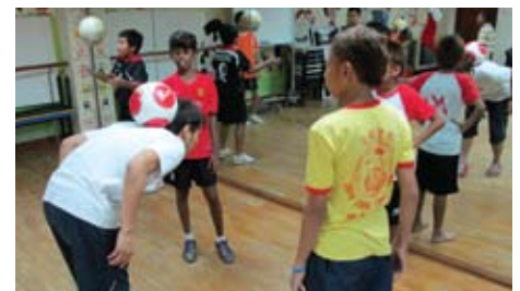
The team training hard for the tournament.