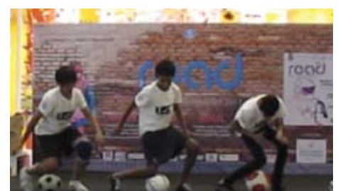
Performing at the launch of The Read .