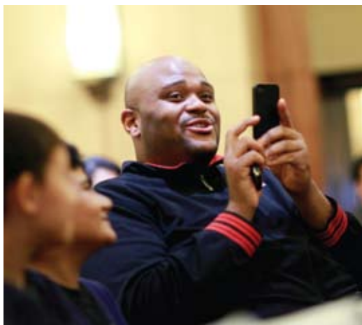
American Idol Season 2 winner Ruben Studdard

The singing sensations were in Singapore for the UBS Sun Festival, one of Singapore's leading multi-arts and lifestyle festivals that draws talent from across the globe. Swiss Bank UBS AG, the presenting sponsor of the Festival, invited our children to meet the stars. The event saw over 130 guests attending from Singapore Children's Society, Asian Women's Welfare Association and The Little Arts Academy.